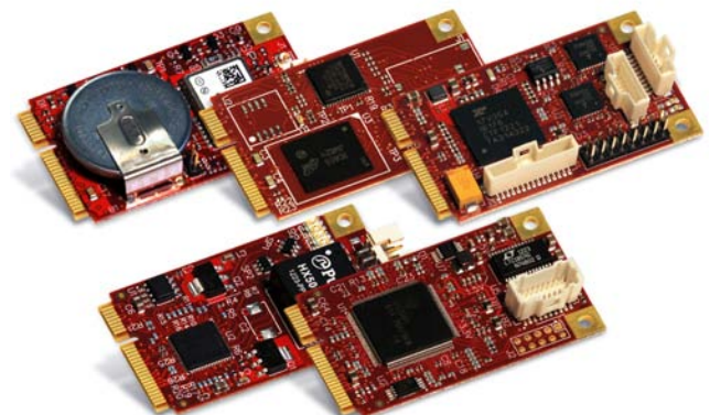
Mini PCIe Modules